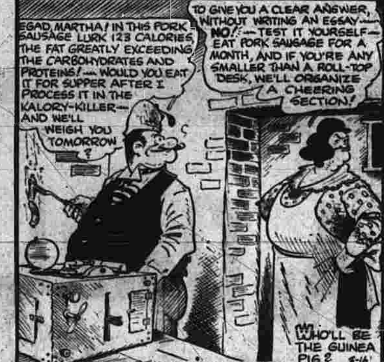
What's It About?