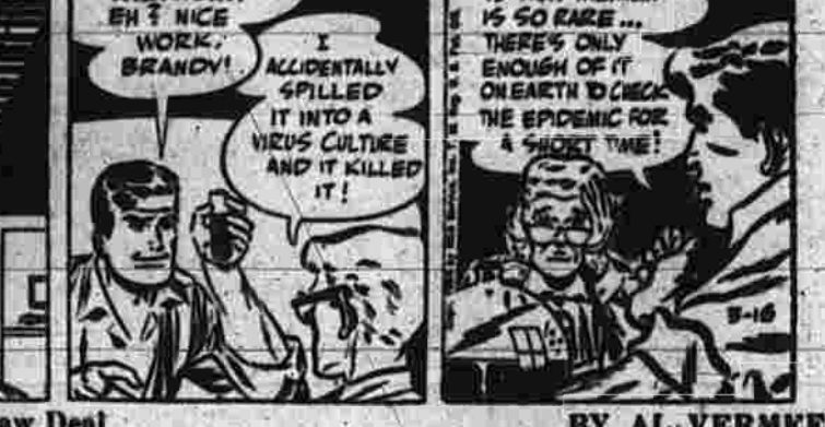
The Raw Deal