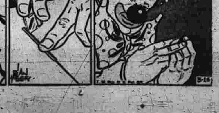
Making a Dart